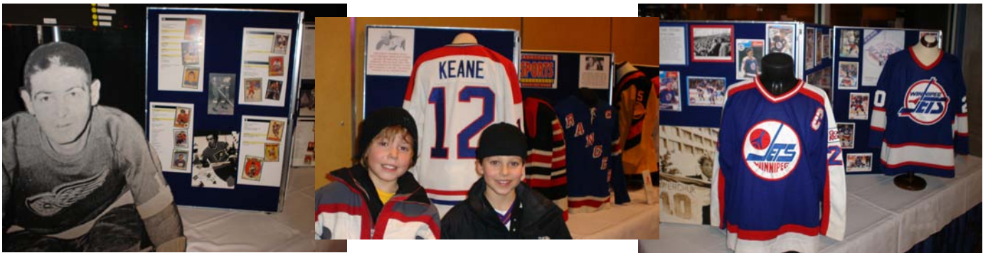
"Made in MB" Exhibit, NHL Jersey Exhibit, Jets Tribute Exhibit

⇒ The Manitoba Sports Hall of Fame teamed up with the Manitoba Hockey Hall of Fame and the Manitoba Moose to build three exhibits for the AHL All-Star Festival held January 31st & February 1st, 2006 in the MTS Centre. The exhibits featured "Made in Manitoba: Where were our NHL Players Born", A Tribute to the History of the Winnipeg Jets and a simple but highly popular jersey display. See photos for examples of each exhibit.