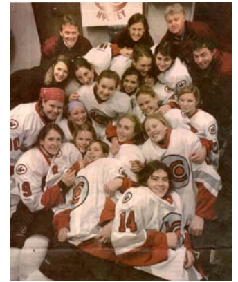
Falcons going to Iceland